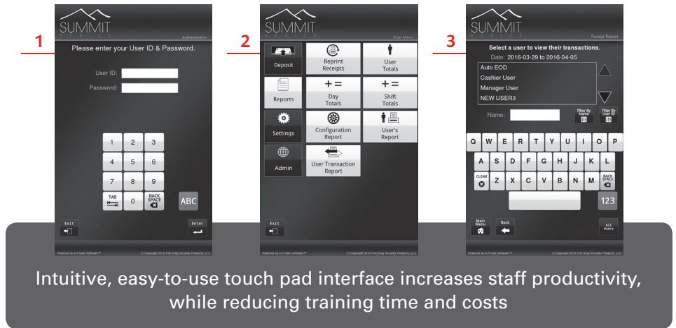
Intuitive, easy-to-use touch pad interface increases staff productivity, while reducing training time and costs