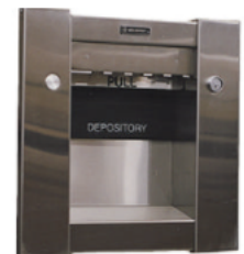
Securifort Replace With: 98RH-20 Kit: 14-012-CANADA Instructions: 14-012 USA