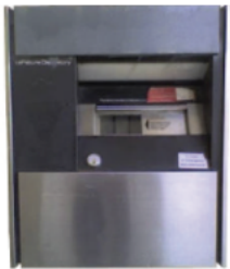
Lefebure – 612 Replace With: 98RH Kit: B6357 Instructions: Doc #08-327