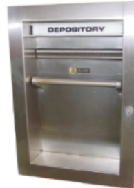
Allied – Nightwatch Dual Replace With: 98RH Kit: 96-440 Instructions: N/A