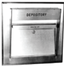
Hamilton – 68B Replace With: 98RH Kit: N/A Instructions: N/A