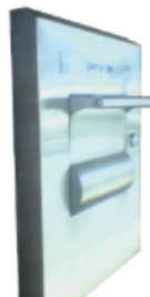
SSE – Replacement Head Replace With: N/A Kit: N/A Instructions: N/A