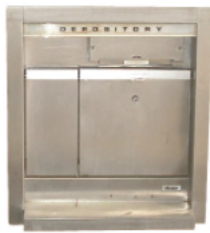
Mosler Magna Dual Recessed Replace: 80UC Kit: 96-450 Instructions: N/A