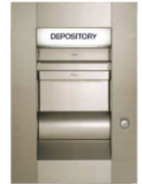
American Vault – 85 Replace With: 80UC Kit: B6883 Instructions: N/A