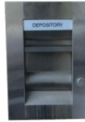
Lefebure – 412 Replace 80UC Kit: B6883 Instructions: N/A