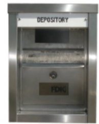
National-Recessed Replace With: 98RH Kit: N/A Instructions: N/A