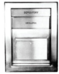
Hamilton – 67R Replace With: 98RH Kit: N/A Instructions: N/A