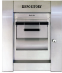
Fortis – AHD106 Replace With: 80UC Kit: N/A Instructions: N/A