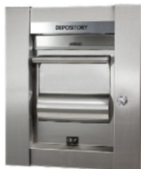
SSE Replace With: 98RH Kit: N/A Instructions: N/A