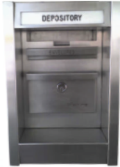
Lefebure – 201 Replace With: 98RH Kit: N/A Instructions: N/A