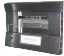
Lefebure – 577 Replace N/A Kit: N/A Instructions: N/A