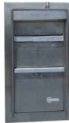
Mosler – C77-DF Replace With: 98RH Kit: B6387 Instructions: Doc #08-329