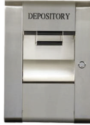
Fortis – AHDR 509 Replace With: 98RH Kit: N/A Instructions: N/A