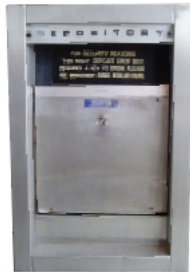
Mosler Magna Bag Only Replace: With 98RH Kit: B6379 Instructions: 08-328