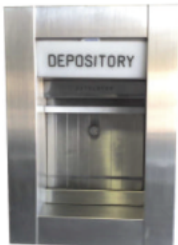
Security Corporation – ND-11 Replace With: 98RH Kit: 96-448 Instructions: N/A