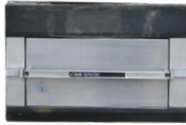
Lefebure – 312 Replace N/A Kit: N/A Instructions: N/A