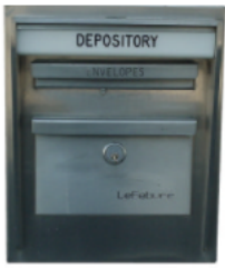
Lefebure – 101 Replace With: 98RH Kit: N/A Instructions: N/A