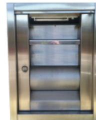
Kumahira – ND-61 Replace With: N/A Kit: N/A Instructions: N/A