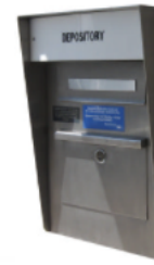
National – Flush Replace With: 98RH Kit: N/A Instructions: N/A