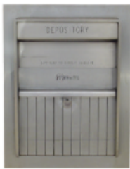
Mosler – Century Replace With: 98RH Kit: 96-470 Instructions: Doc #08-331