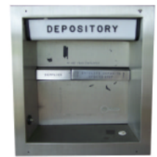
Mosler – C77- ER Replace With: N/A Kit: N/A Instructions: N/A