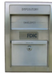
Hamilton – 68F Replace With: 98RH Kit: N/A Instructions: N/A