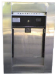
Mosler - American Replace: 98RH Kit: B6379 Instructions: 08-328