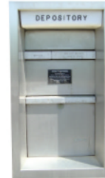
Mosler – C77-DR Replace With: 98RH Kit: B6394 Instructions: Doc #08-330