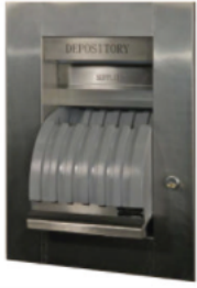
Diebold – Cashgard Replace With: 80UC Kit: B6883 Instructions: N/A